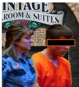
On the way into the reception